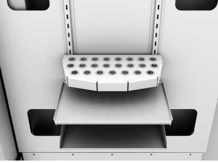
Toolholder Rack and Convenient Shelf